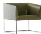
Gavi L FG 343.02