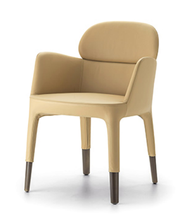
360° | Gallery